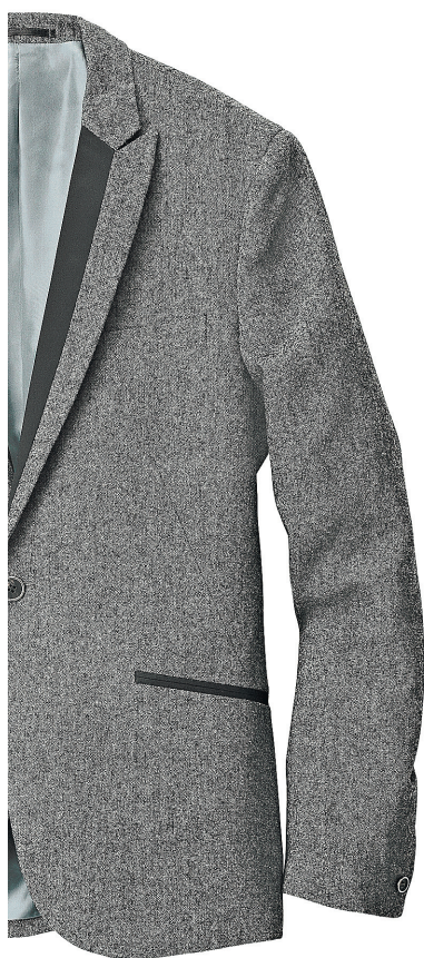
The collection for men includes blazers like this one for $69.95.

ARIZONA DAILY STAR H&M (Hennes & Mauritz), the popular fashion retailer, has announced its grand opening at Park Place: noon on Oct. 20. The store in the mall at 5870 E. Broadway will offer collections for women and men, and for children from newborns to age 14. The opening coincides with H&M's promotion of its fall color palettes, including "camel, burgundy, cognac, pumpkin and muted jewel tones," the company said Thursday in a news release. Key items for women, H&M says, will include knit dresses for $19.95, blouses starting at $17.95, and blazers starting at $29.95. For men, shirts start at $9.95, basic T-shirts at $5.95, and trousers at $19.95. On opening day at Park Place mall, H&M says it will offer the first 200 shoppers in line a T-shirt and access to a fashion pass valued from $10 to $300, in addition to other giveaways. If H&M's opening in August 2010 at its first local store, at Tucson Mall, is any indication, long lines will form for those promotions.